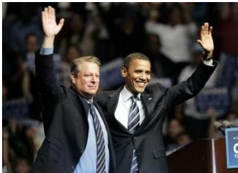
Al Gore and Barack Obama appear on stage in Michigan as the former endorsed the current candidate for president on June 16, 2008.